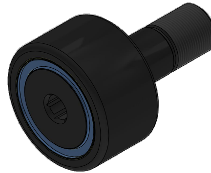
ISO VIEW SCALE .375:1